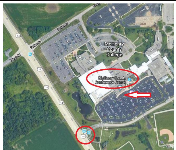
NEW LOCATION MAP OF McHenry County College

Mc Henry County College 8900 Route 14 Crystal Lake, IL January 10 th @ 7pm