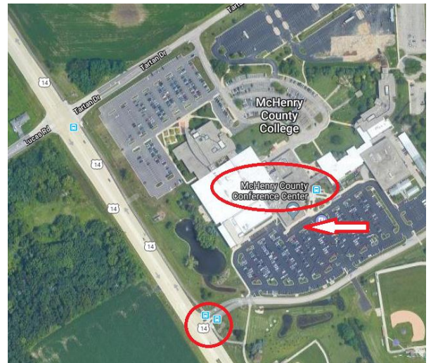
NEW LOCATION MAP OF McHenry County College

McHenry County College Room B166-167 8900 Route 14 Crystal Lake, IL