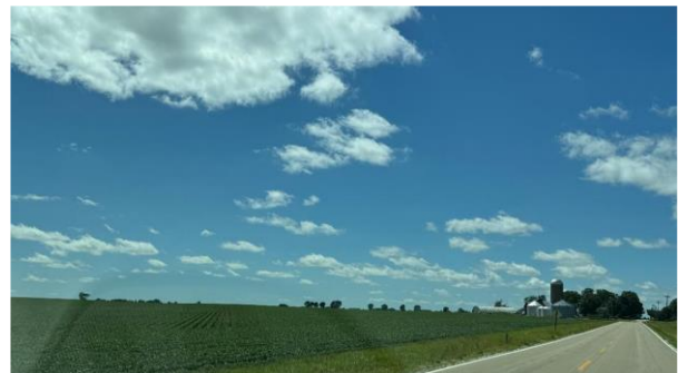
Wiley Family Farm, established 1844

farmed in the late 1844's and grabbed a few photos while I was there. It was a lovely way to spend an afternoon.