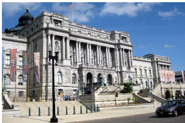
Photo by Wally Gobetz, 2009 Library of Congress https://flickr.com/photos/wallyg/

One item Tina focused on was the National Digital Newspaper Project (NDNP), including the fact that there are newspapers on Flickr. She also told us about the Digital Newspaper Collections as well as the Veteran's History Project. The Veteran's History Project collects first person accounts of veterans in order to preserve their knowledge. Tina also shared information on the Bird's Eye Maps, the San Borne Fire Insurance Maps, the fire insurance maps of other companies (yes, there are some), as well as the Prints and Photos collection at the Library of Congress.